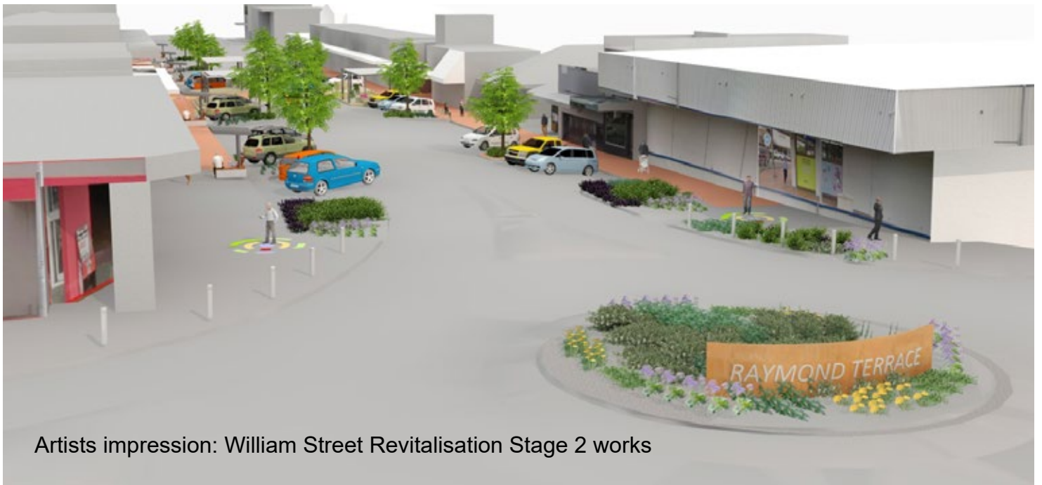
Artists impression: William Street Revitalisation Stage 2 works